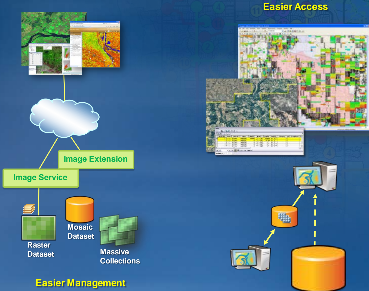
Image Server Provides a Solution